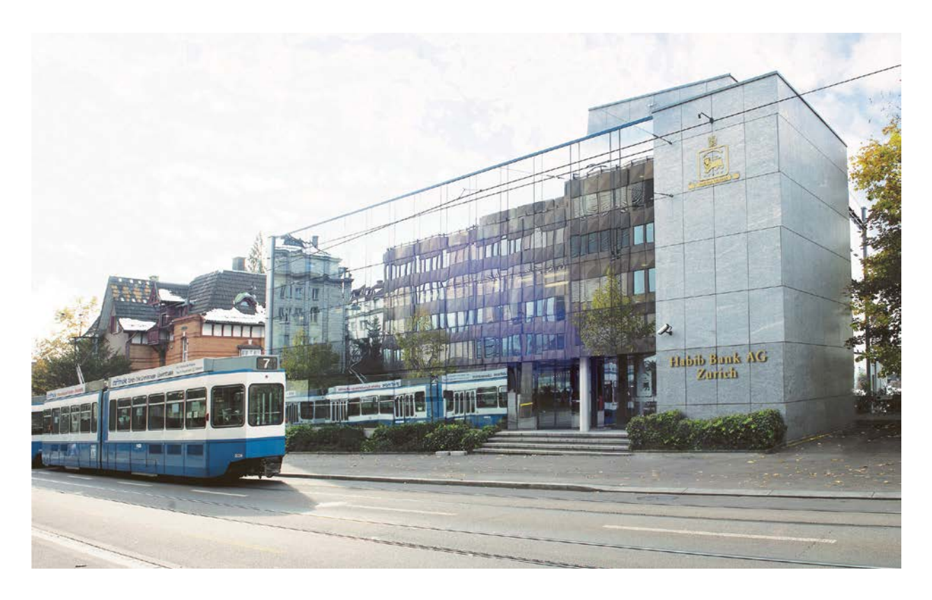
Habib Bank AG Zurich Head Office

to climate. The core provision of the OCD is art. 2 para 1, which establishes the presumption that the obligation to report on climate matters is fulfilled if the report is based on the recommendations of the Task Force on Climate-Related Financial Disclosures (TCFD). We will follow the climate-related financial disclosure recommendations issued by the TCFD and TCFD-based reporting on climate matters that will become mandatory for our organization starting as of the 2024 reporting year.