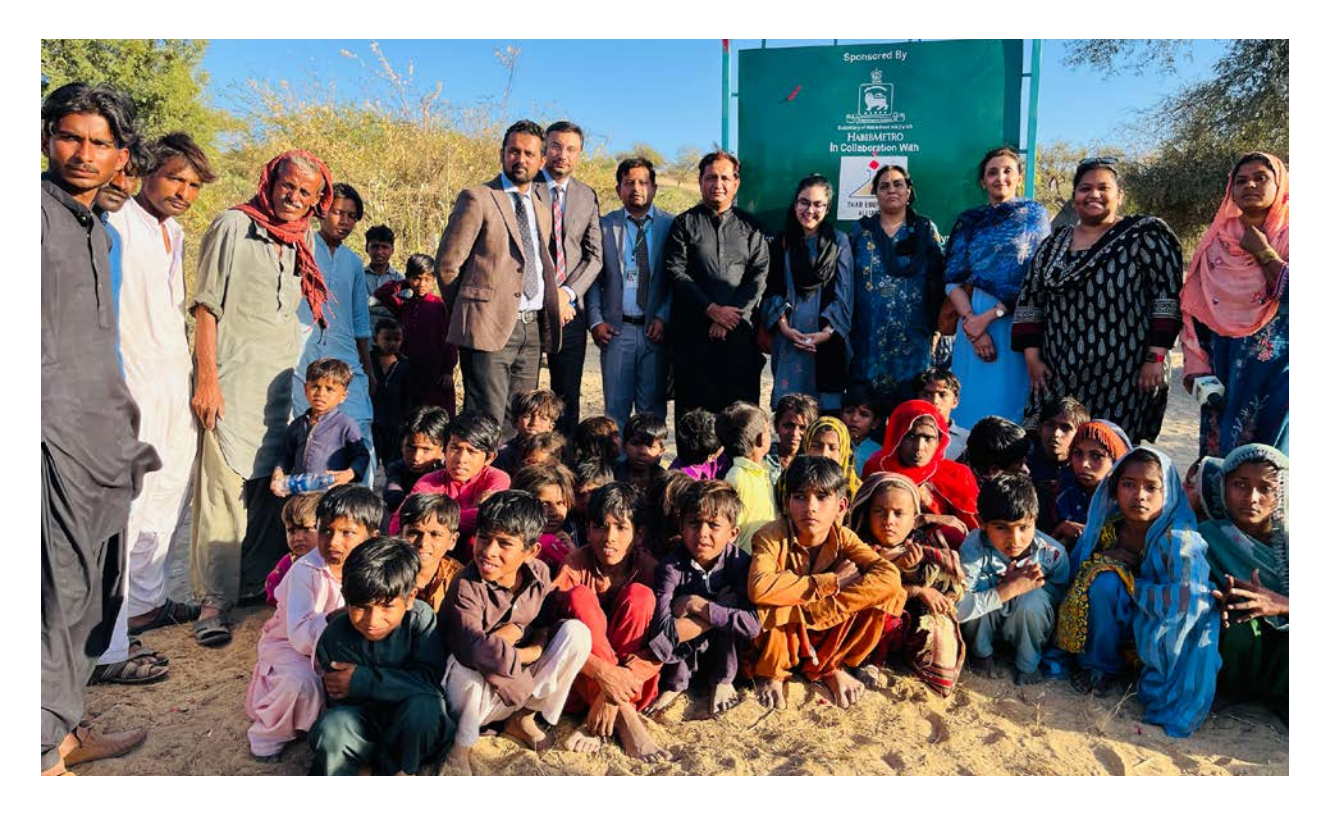
Thar education alliance installation of solar panels to provide electricity to 35 households

our identity that has existed long before it became a general focus of corporate awareness. Our principal areas of focus are health, education, and local communities.