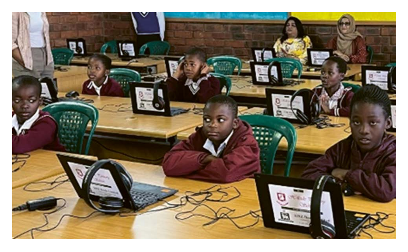
Hillside School funding for laptops and IT programs